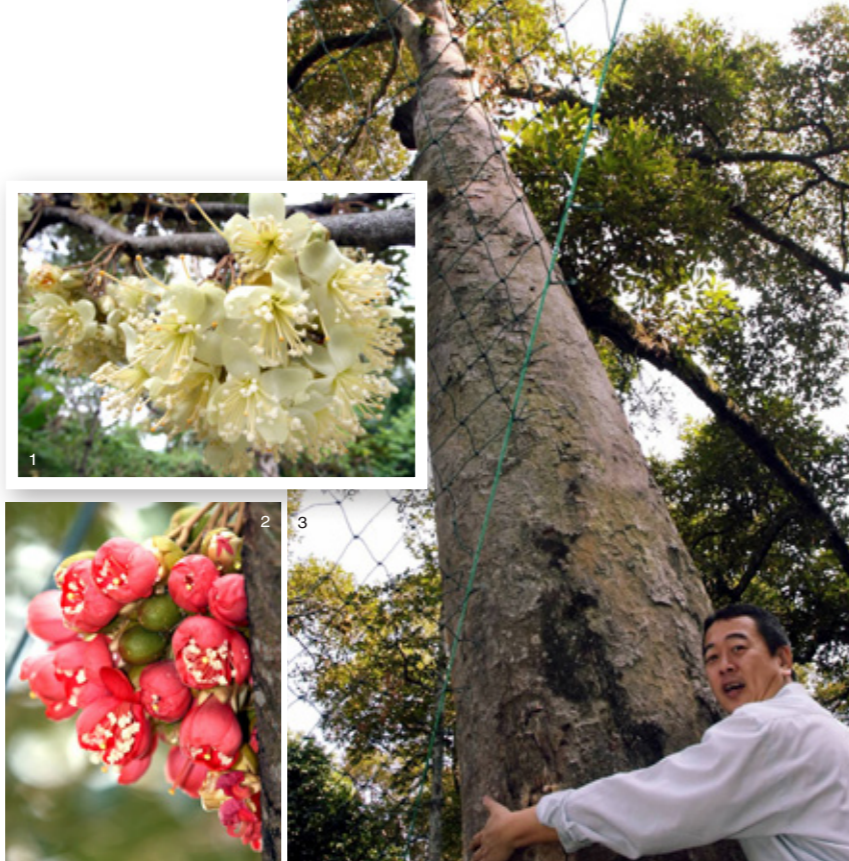
1&2. The colour of the durian flowers hints at the type of durian it produces – yellowish flowers for pale yellow-fleshed durians, and reddish flowers for durians with an orangey-red pulp. 3. Chang hugging a 60-year-old durian tree to show just how big a mature tree can get.

Then came the memorable ending: Ang Hae from a 25-year-old tree. My tongue went numb for a few seconds as I bit into it; then, a pronounced aroma accompanied the full-bodied, custardy taste with cognac overtones, making the experience simply sublime!